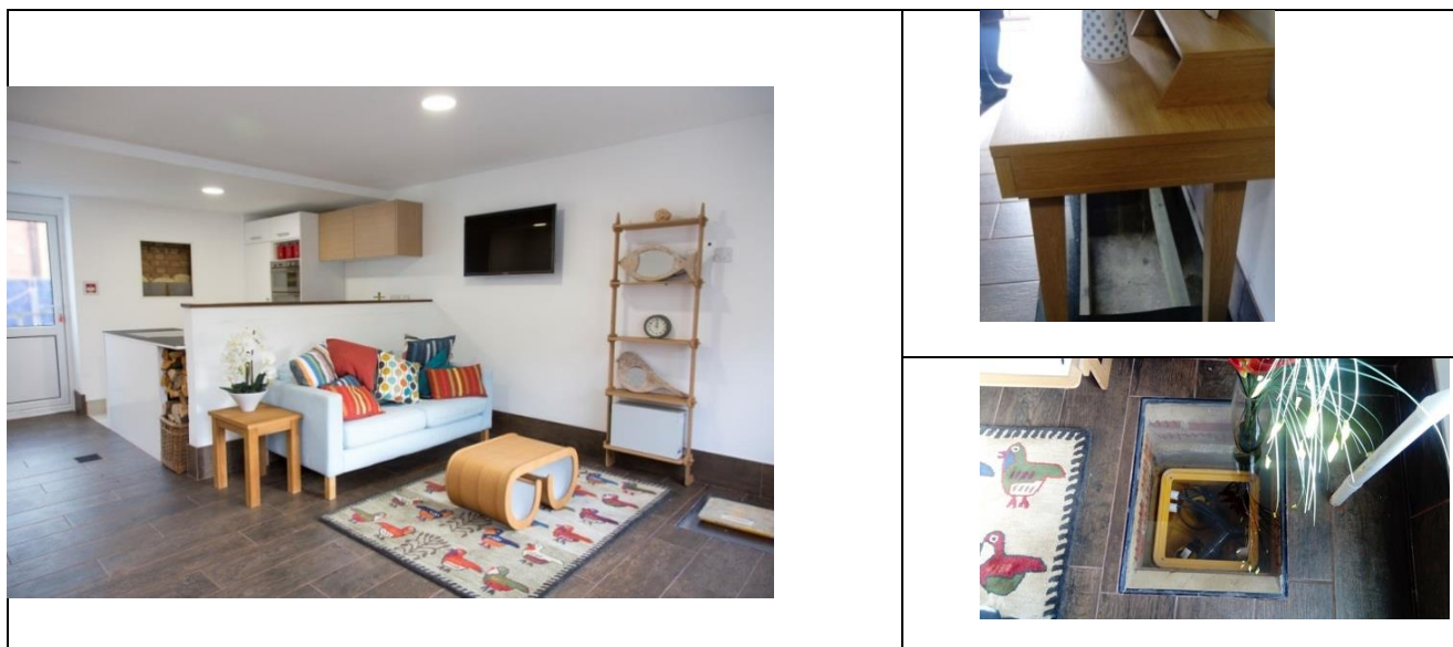
Figure 5: BRE Watford, Flood Recoverable Demonstration Building

84. Property owners are most likely to accept such approaches where they do not adversely impact on the appearance of the property or the way it is used. BRE (the Building Research Establishment) has a demonstration property in Watford 6 . Business-In-The-Community (BITC) also developed a guide based on work to demonstration properties in Carlisle 7 after the 2015/16 floods. Short Case Studies showcasing the work at the Botcherby Community Centre 8 and Edenside barn 9 can also be found at www.floodguidance.co.uk