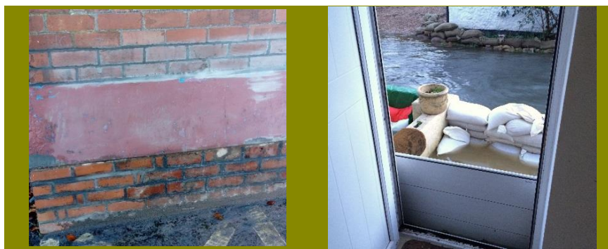
Figure 4: Flood Resistance, Brickwork and Barriers