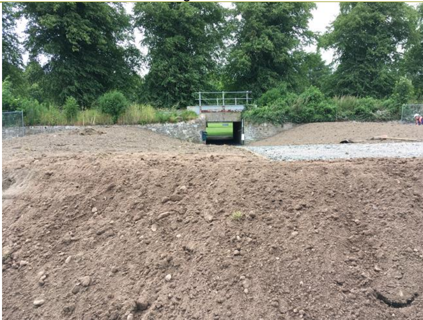
The newly constructed flood embankment at Tyne Green, July 2018.

The majority of affected households agreed to collaborate and pool their individual PFR grants of £5,000 per property. In this unique and innovative way, a £65,000 pot of funding was established to finance the community-level scheme. Delivery of the scheme was led by the Environment Agency, who, in order to take receipt of the funding, entered into a legally-binding contribution agreement with Northumberland County Council, administrators of the PFR grant scheme.